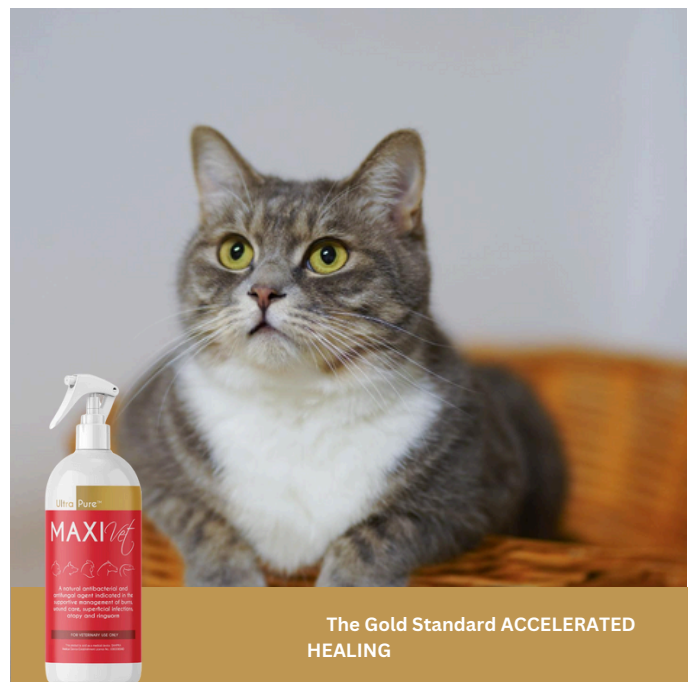
The Gold Standard ACCELERATED HEALING