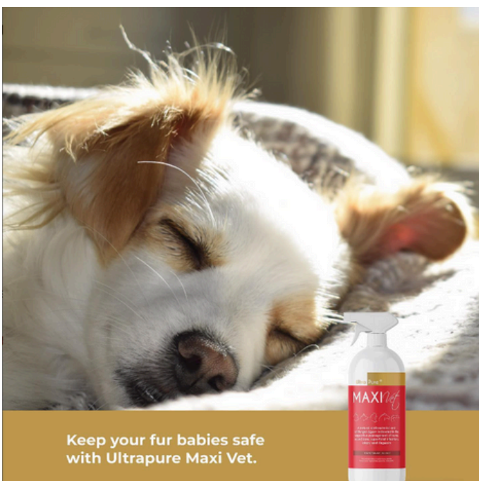
Keep your fur babies safe with Ultrapure Maxi Vet.

A propriety blend of Ultrapure® stabilised HOCl (Hypochlorous acid at 330 – 370 ppm)